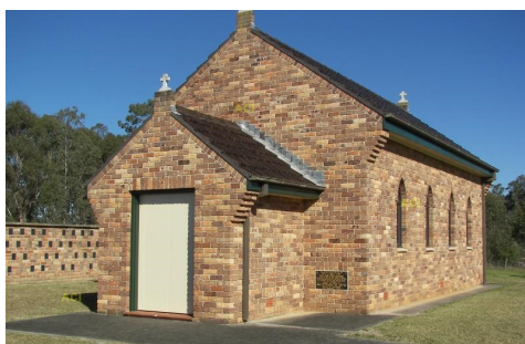
St Francis Xavier Church - Greendale