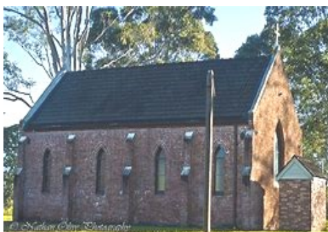
St Mary Church - Mulgoa