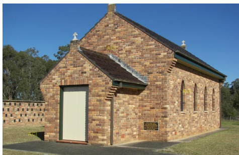
St Francis Xavier Church - Greendale