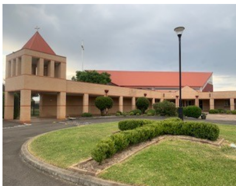
Holy Family Church - Luddenham

LUDDENHAM-WARRAGAMBA THE MOST HOLY BODY AND BLOOD OF CHRIST - YEAR 1/B 6 JUNE 2021