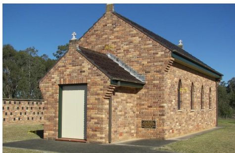
St Francis Xavier Church - Greendale