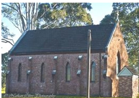
St Mary Church - Mulgoa