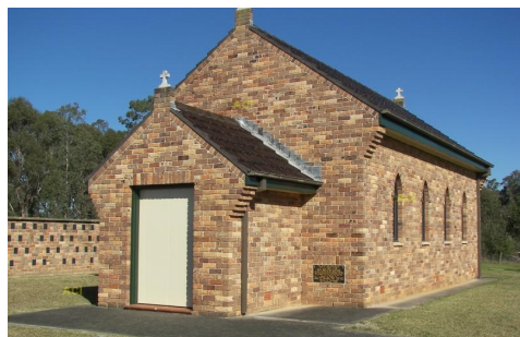
St Francis Xavier Church - Greendale