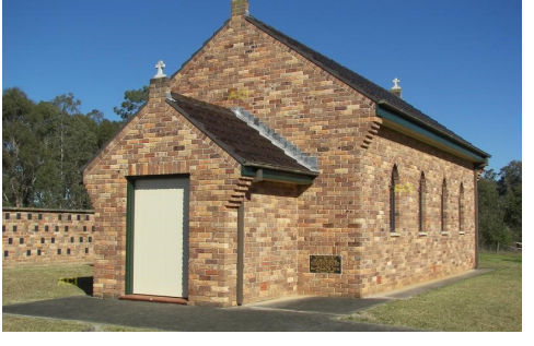
St Francis Xavier Church - Greendale