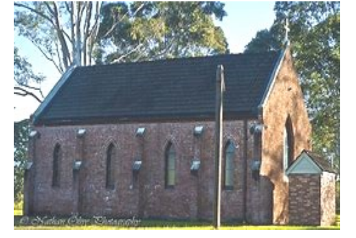
St Mary Church - Mulgoa

Tuesday: 9:30am - 4:00pm Thursday: 9:30am - 4:00pm