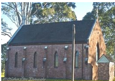
St Mary Church - Mulgoa