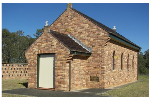
St Francis Xavier Church - Greendale