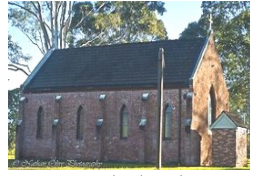
St Mary Church - Mulgoa