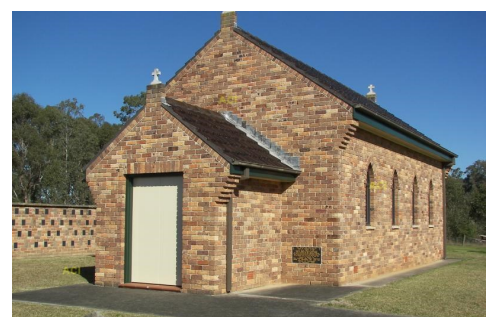
St Francis Xavier Church - Greendale