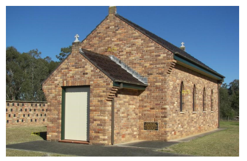
St Francis Xavier Church - Greendale