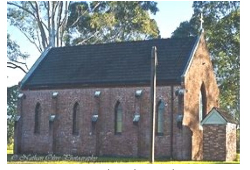
St Mary Church - Mulgoa