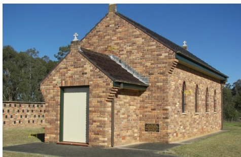
St Francis Xavier Church - Greendale