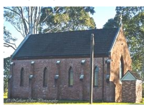
St Mary Church - Mulgoa