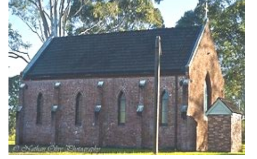
St Mary Church - Mulgoa