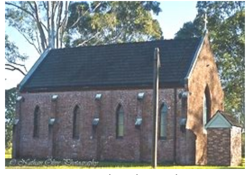
St Mary Church - Mulgoa