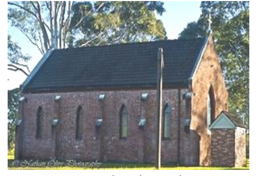
St Mary Church - Mulgoa