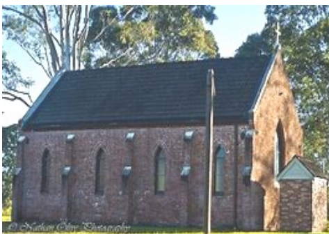
St Mary Church - Mulgoa