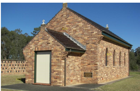
St Francis Xavier Church - Greendale