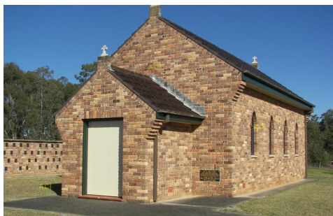
St Francis Xavier Church - Greendale