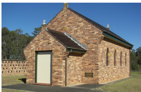
St Francis Xavier Church - Greendale