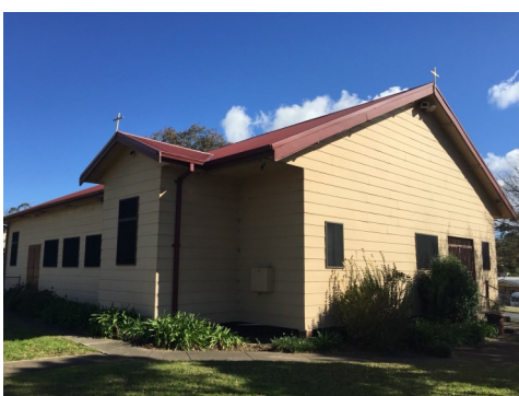
Sacred Heart Church - Warragamba