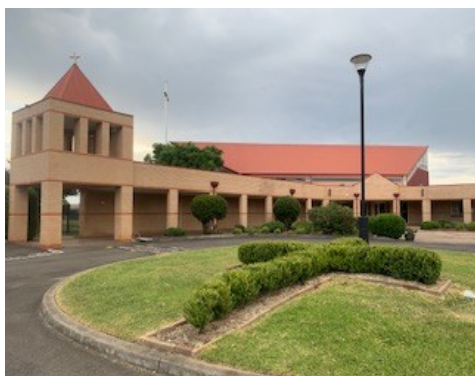
Holy Family Church - Luddenham