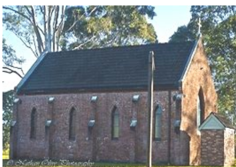
St Mary Church - Mulgoa