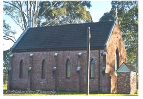
St Mary Church - Mulgoa