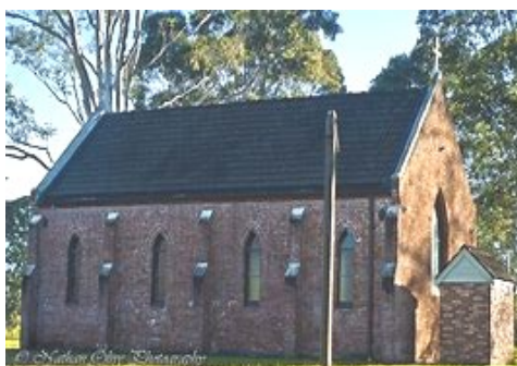
St Mary Church - Mulgoa