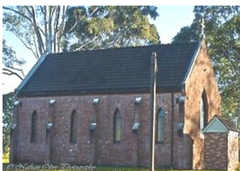
St Mary Church - Mulgoa