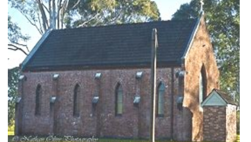
St Mary Church - Mulgoa