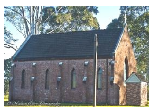
St Mary Church - Mulgoa