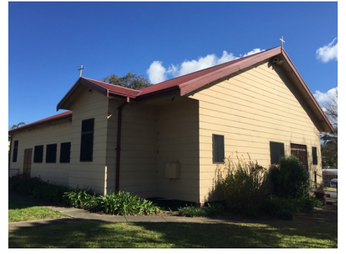
Sacred Heart Church - Warragamba