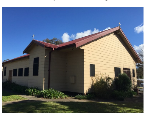
Sacred Heart Church - Warragamba

First Friday of month at 9.30am Mass or by appointment.