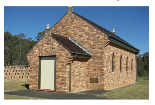
St Francis Xavier Church - Greendale