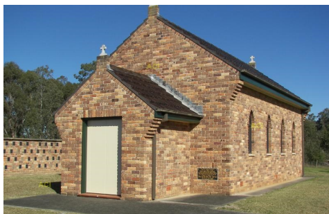
St Francis Xavier Church - Greendale