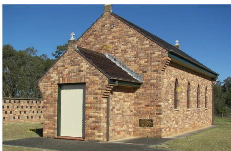
St Francis Xavier Church - Greendale