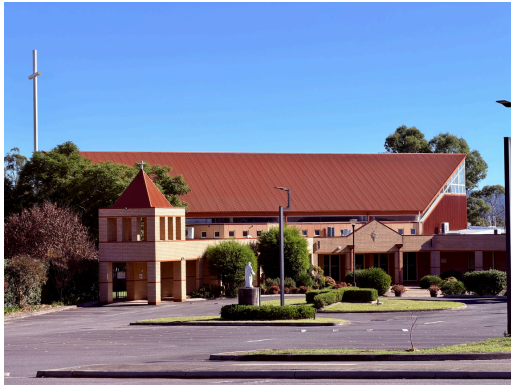
Holy Family Church, Luddenham