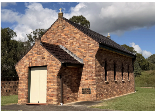
St Francis Xavier Church, Greendale