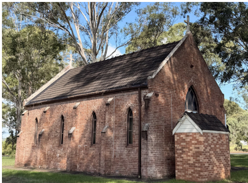
St Mary's Church, Mulgoa