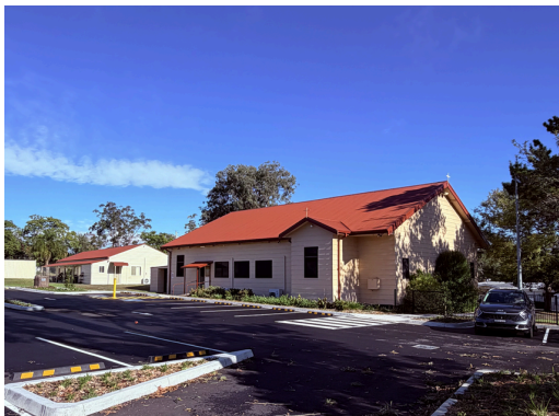
Sacred Heart Church, Warragamba