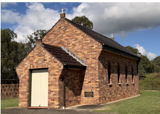
St Francis Xavier Church, Greendale